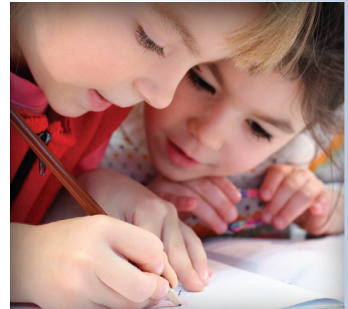
Schnepf Elementary: A school featuring STEAM and Leader in Me (opening July 2021)